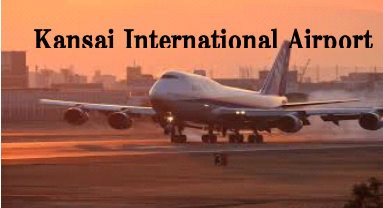
Kansai International Airport

Enjoy a relaxing trip in Kansai freely and without carrying any baggage.